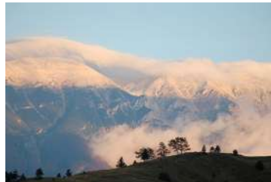
La Majella: montagna sacra per gli abruzzesi