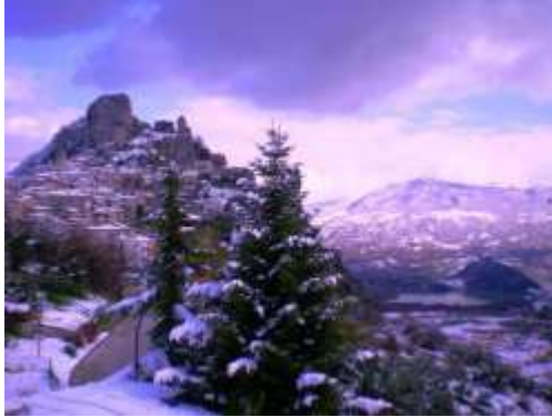
Pennadomo: paesaggio invernale