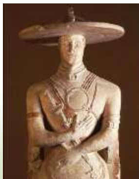
Chieti: museo archeologico (il guerriero di Capistrano)