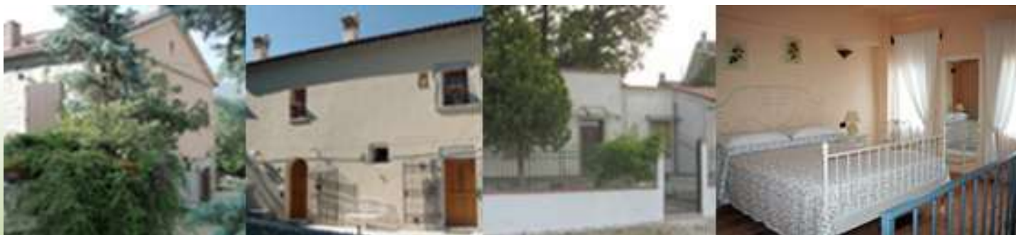
Case-Vacanza "Le Terre di Baronessa"