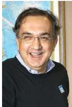
Sergio Marchionne (Chieti, 17 giugno 1952)