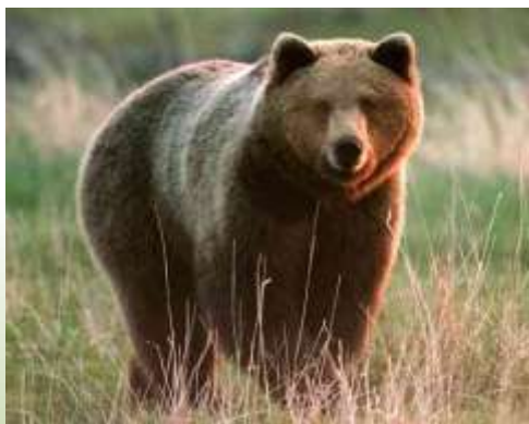
Parco Nazionale Lazio-Abruzzo: Orso Marsicano