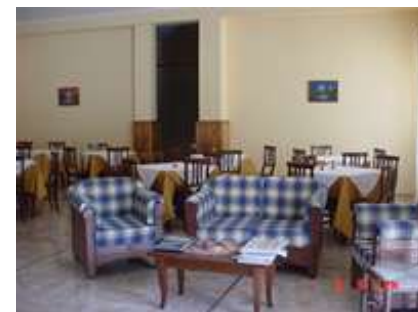
Albergo/ostello Cascate del Verde