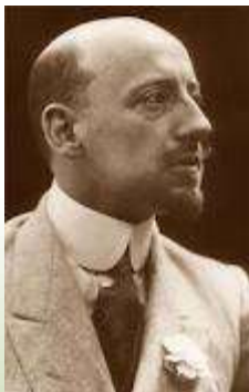
Gabriele D'Annunzio (Pescara, 12 marzo 1863 – Gardone Riviera, 1º marzo 1938)