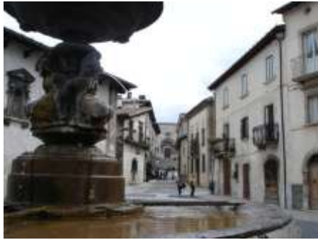
Pescocostanzo: view of the center