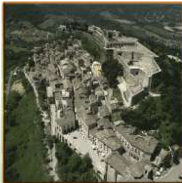
Civitella del Tronto: Fortezza Borbonica