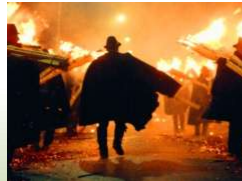
Agnone: la 'ndocciata