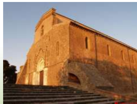
Fossacesia: l'Abbazia di S. Giovanni in Venere