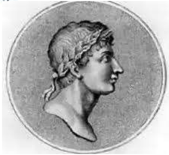
Publio Ovidio Nasone (Sulmona, 20 marzo 43 a.C. – Tomi, 18 d.C.)