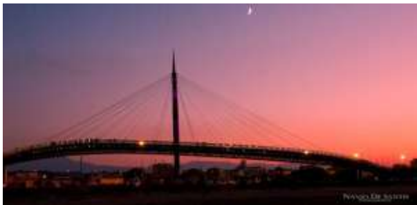
Pescara: ponte del mare