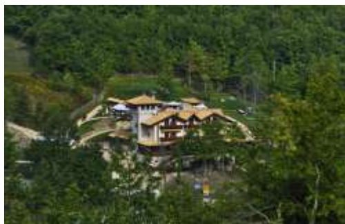
Hotel Villa Danilo