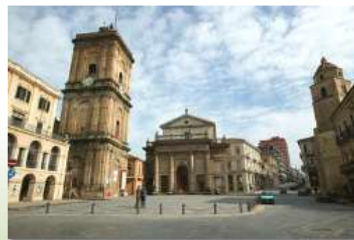
Lanciano: Piazza Plebiscito