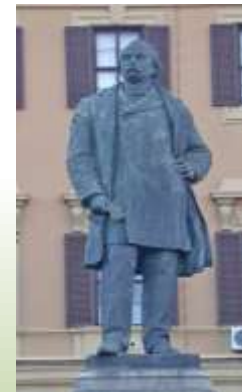
Silvio Spaventa (Bomba 12 maggio 1822 - Roma 20 Giugno 1893)