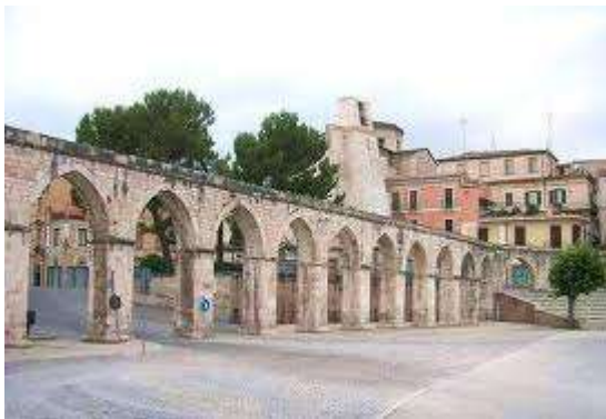
Sulmona: la Patria di Ovidio e terra dei confetti