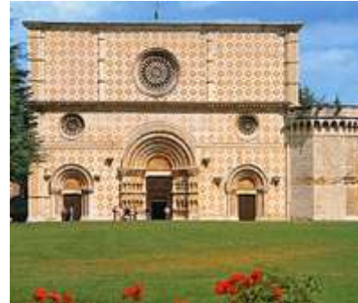
L'Aquila: Basilica di Collemaggio