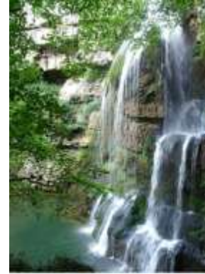
Borrello: le Cascate più alte dell'Appennino