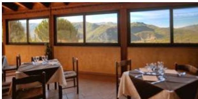
Il Nido delle Rondini