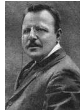
Benedetto Croce (Pescasseroli, 25 febbraio 1866 – Napoli, 20 novembre 1952)