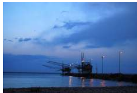
La Costa dei Trabocchi (CH)