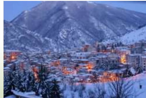
Scanno: winter landscape