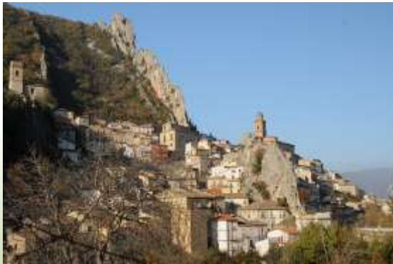
Villa S. Maria: la patria dei cuochi